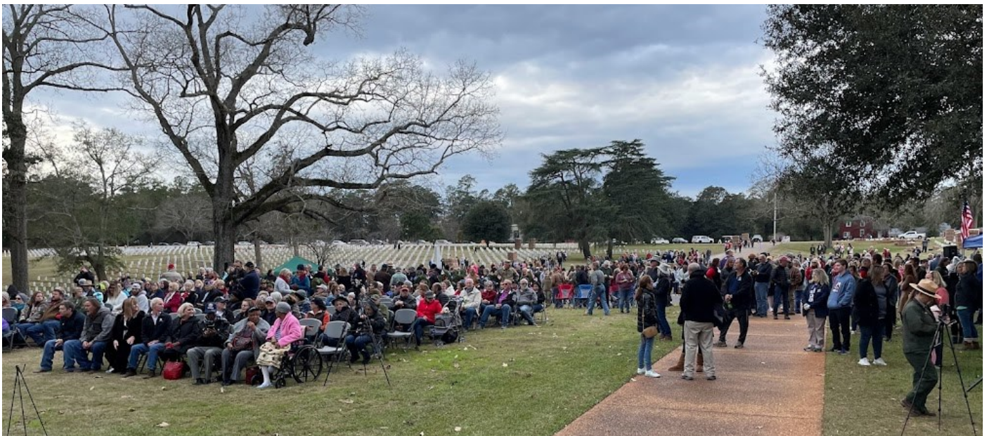
The crowd of volunteers assembles at the Cemetery rostrum before the ceremony for Wreaths Across America.

Friends of Andersonville PO Box 113 Andersonville, GA 31711